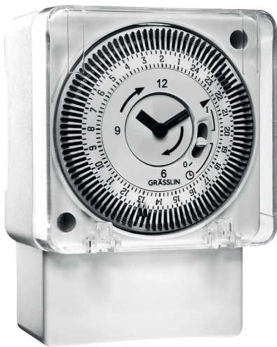
tactic 111 A

Analogue time switches, Front panel/wall installation, switching segments