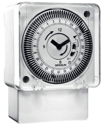
tactic 211 A (OA)