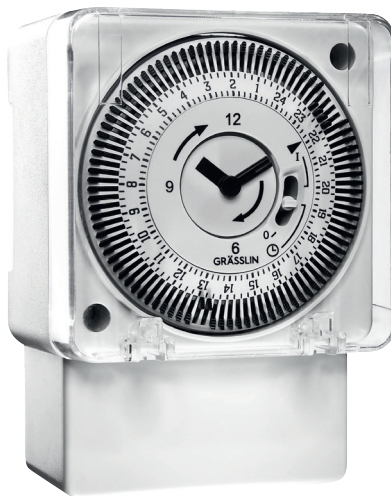
tactic 211 A